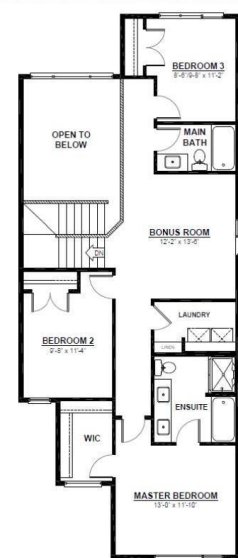
2ND FLOOR 1,084 SQ.FT (8 FT. CEILINGS)