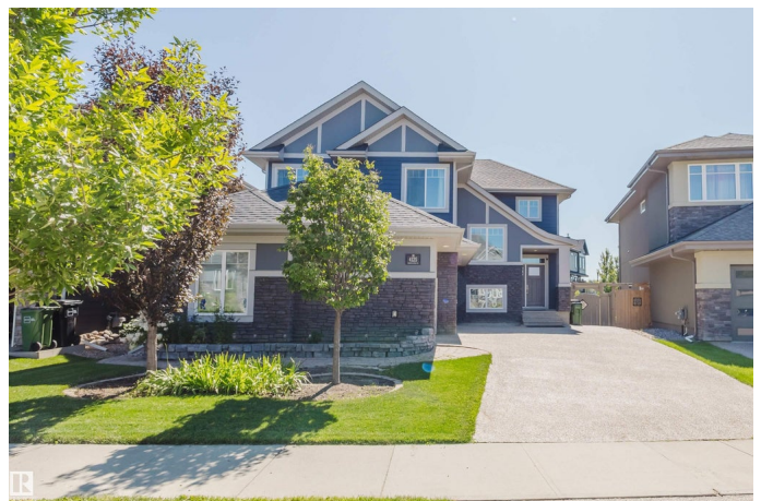
4125 Kennedy Green SW, Edmonton, AB

Main Floor Exterior Area 1236.94 sq ft Interior Area 1158.39 sq ft Excluded Area 737.06 sq ft