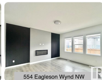
554 Eagleson Wynd NW